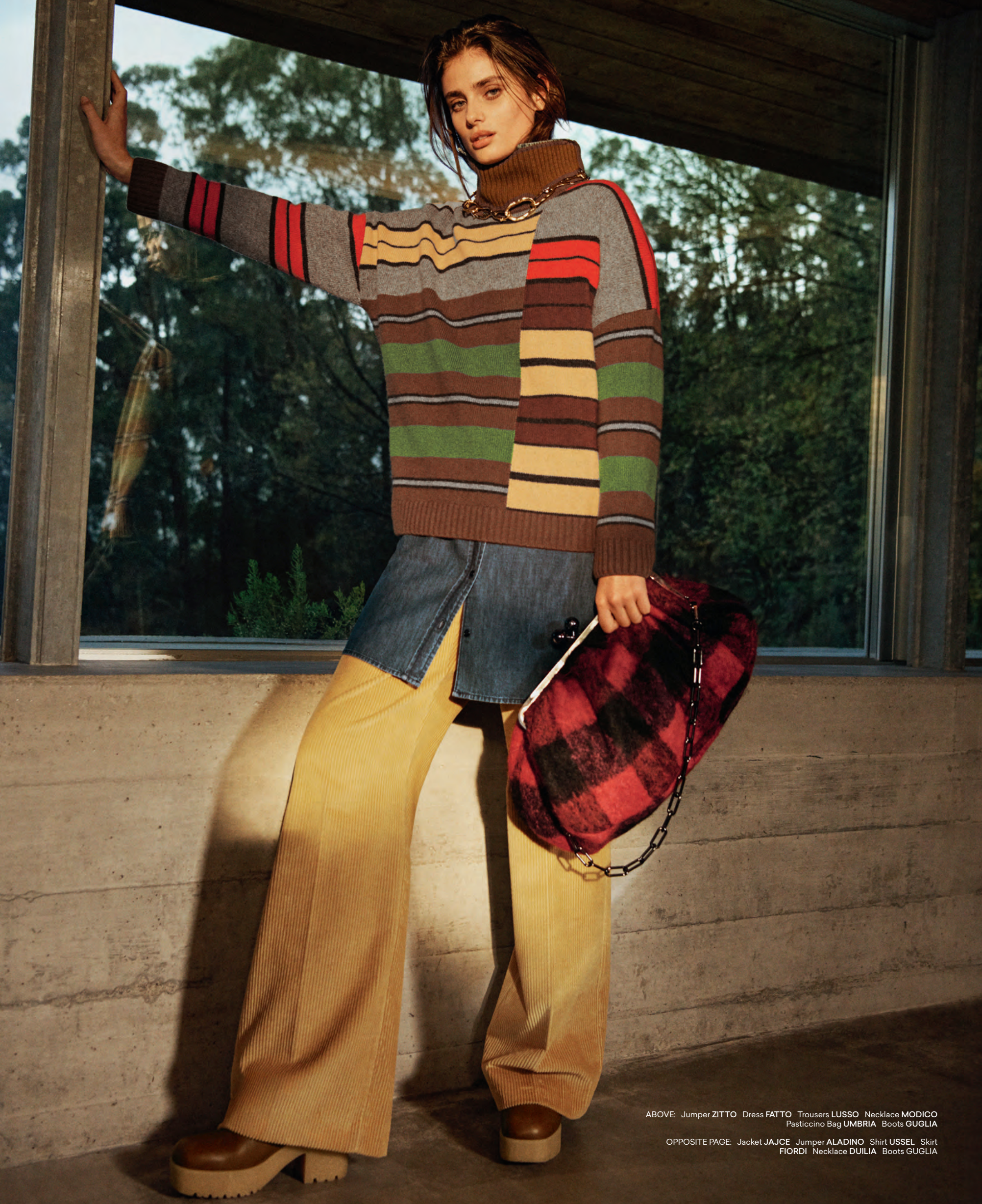
ABOVE: Jumper ZITTO Dress FATTO Trousers LUSO Necklace MODICO Pasticcino Bag UMBRIA Boots GUGLIA OPPOSITE PAGE: Jacket JAJCE Jumper ALADINO Shirt USSEL Skirt FIORDI Necklace DULIA Boots GUGLIA