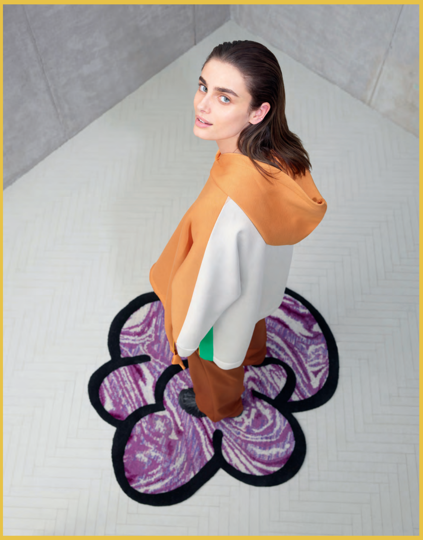
ABOVE: Hoodie RENANIA Trousers GODEZIA Boots SORAGA

As for the Pasticcino Bag, Urquiola reinterprets the brand's iconic design with two fabrics: one with a padded vertical pattern for a 3D effect and the other one with diagonal lines that create an iridescent glow. The Pasticcino Bag's distinctive boule clasps are further enlarged, creating an even bolder statement.